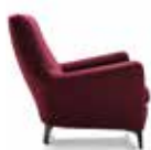
5 DENNY ARMCHAIR CM 88X95 H88