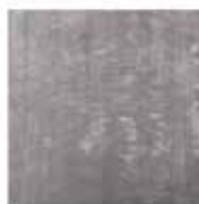
11 DIBBETS RUG CM 500X400