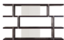
10 DALTON BOOKCASE CM 360X40 H148